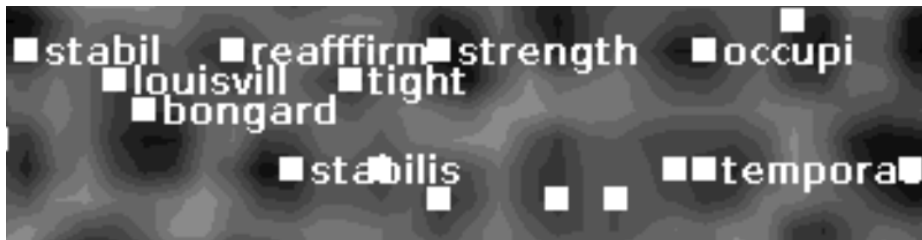
Fig. 3. A cropped section of the U-matrix with best matching units and labels, showing a tight cluster. Some labels are not displayed as they overlapped with others.

We trained the map starting with random weights, hence local regions are topologically meaningful, but neighbouring regions in the map may be entirely unrelated.