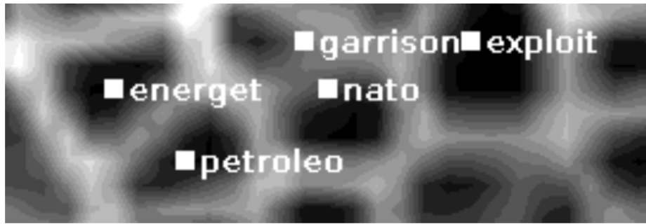
Fig. 4. A cropped section of the U-matrix with best matching units and labels, showing large gaps between words.

temporao , tight . Some are clearly related, for others, we need to look at the corpus for justification. The expression Bongard appears in two senses: the corrupt head of a bank, and as the name of a brokerage firm. ITA always refers to the International Tin Association, which was debating a pact extension at the time. Temporao is a kind of cocoa, firms trading it were listed on stock exchanges. Louisville as a location appeared frequently in the economic news typical in this test collection. The gaps are small between these words, which does not necessarily rule out the insertion of new words in the gaps, but based on the limited vocabulary a newswire, the lexical field represented by these expression appears to be covered.