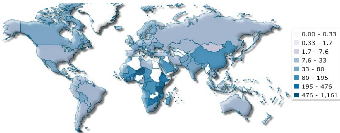
Figur 1: https://www.indexmundi.com

The map below shows how Government expenditure per student, tertiary (% of GDP per capita) varies by country. The shade of the country corresponds to the magnitude of the indicator. The darker the shade, the higher the value.