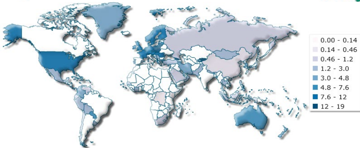
Figur 2: https://www.indexmundi.com

When students apply to a master's degree programme, they must show that they have the necessary background, or prerequisites, to be successful in the programme. Most of the time, they must hold a bachelor's degree in the field in order to be admitted to a master's degree programme. Some graduate-level programmes don't require you to have a degree in a particular subject, while others require a degree in a related discipline. Some programmes will also require that you meet certain course prerequisites, for example certain healthcare programmes will require that you have a predetermined amount of clinical or laboratory experience.